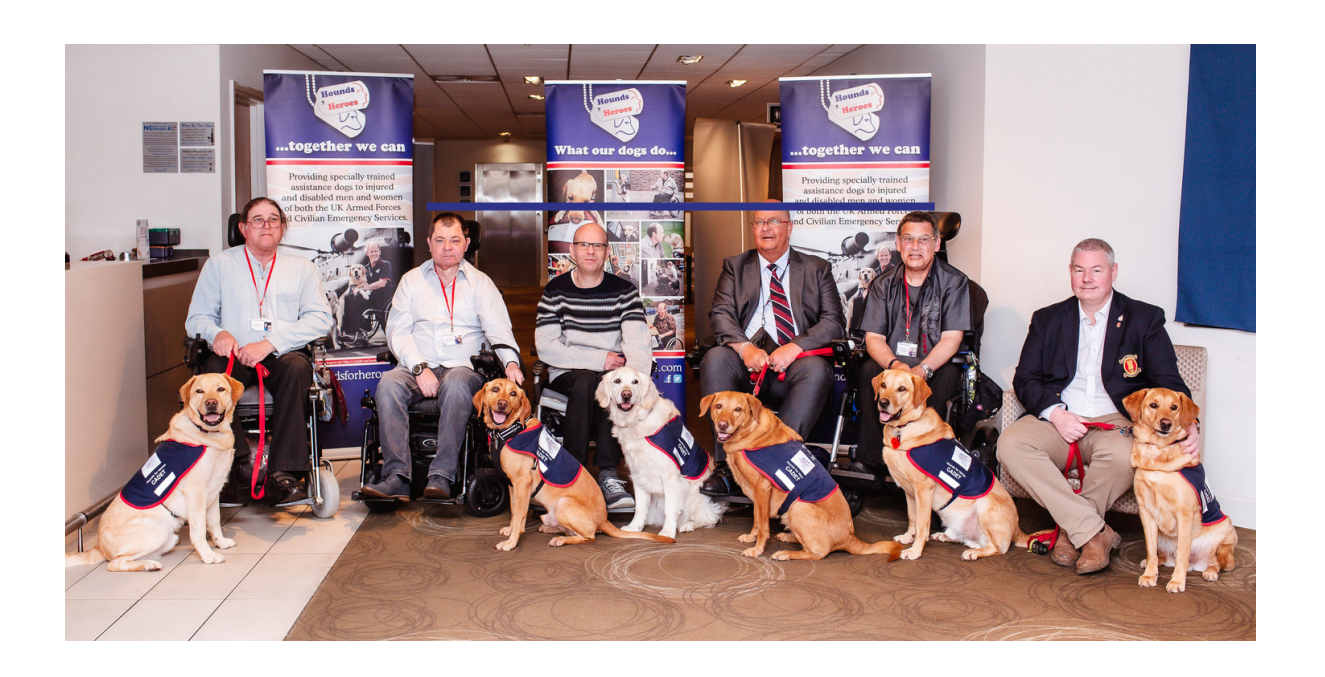
Partners quote "All I can say is thank you for giving me my life back"

Our puppies are recruited from 8 weeks old from trusted and reputable breeders, where they start to train and develop their skills, the training programme takes around 2 years to complete until they are ready to be partnered with a beneficiary. A Hounds for Heroes assistance dog can help overcome some of the physical challenges caused by disability or illness. Our life enhancing dogs can assist in those everyday tasks that cause difficulties, they provide a loyal comrade and in many cases; the beginning of a new life.